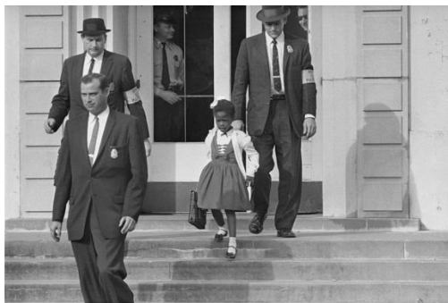
1960.