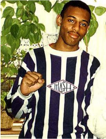
Photograph of Stephen Lawrence.