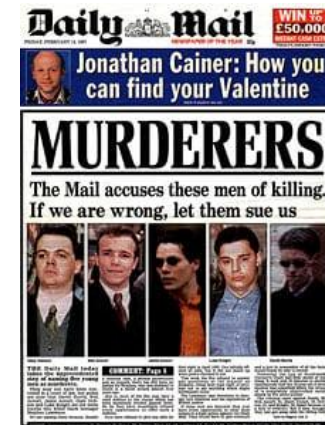
Original publication: Daily Mail (14 February 1997)

Reading into this case will help you to understand more about Blackman's motivation for writing Noughts & Crosses. She does not attempt to mirror the event of Stephen's murder, but rather uses the circumstances and context to build a narrative centring the way that injustice supports the representation of the powerful in society and the toxicity of racism leading to shocking injustice.