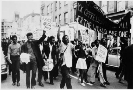
Figure 1 A peaceful group of protesters were followed by many police officers. Catalogue reference: MEPO 31/21.

Caribbeans would apply for jobs and be routinely turned down, although they were allowed to work in more menial roles.