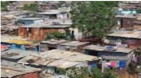
Matt-80, A shanty town in Soweto, South Africa. Photograph. 2005.

Apartheid was inspired by the systems put in place by the Nazis, namely the Nuremberg Laws and the Jim Crow Codes of the Southern states (America).