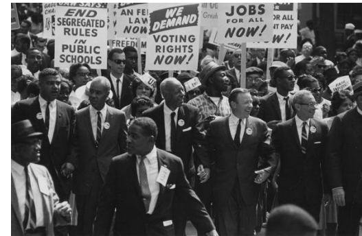
Civil Rights March on Washington, D.C.

The National Guard had to be called in to protect the Black students, reinforced by an executive order from President Eisenhower compelling federal troops to assist in desegregating schools.