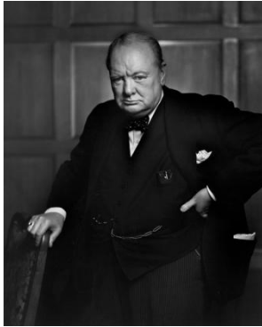
Yousuf Karsh, The Roaring Lion . Photograph. 1941.