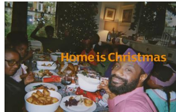
Gravy Song , Sainsbury's, Dec 2020.

'The outrage over Sainsbury's Christmas ad with a Black family proves it: racism in the UK never stopped' Independent