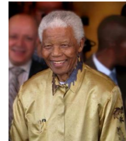
Nelson Mandela in Johannesburg, South Africa The Good News. 2008.

Black people were not allowed to live amongst white people, even though a key part of their function was to service white society. Townships were set up around cities and along with the introduction of identity cards, Black people existed under curfew, their living conditions a stark contrast to the Afrikaan ruling class.